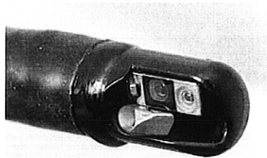
Figure 1: Close-up view of an ERCP endoscope tip.

Device: All ERCP endoscopes (side-viewing duodenoscopes)